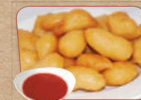
Sweet & Sour Chicken