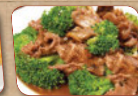
Beef w. Broccoli